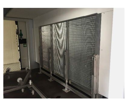
Fig.3: Inside cold storage / evaporator

Am Wehrhahn 50 40211 Düsseldorf, Germany +49 211-179225-0 refrigerants@daikinchem.de daikinchem.de