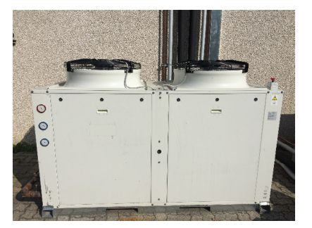
Fig.1: Condensing unit